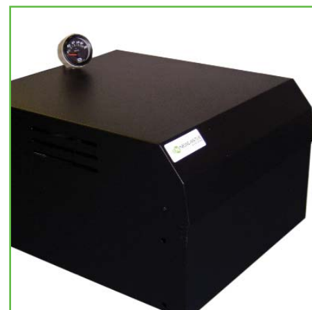
Enclosed power package with battery status meter