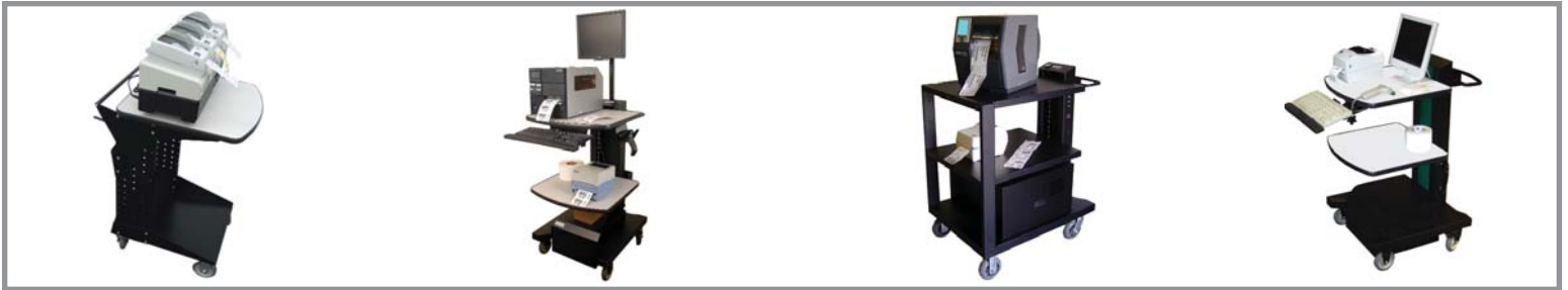
Mobile Powered Workstations, Accessories & Power Packages