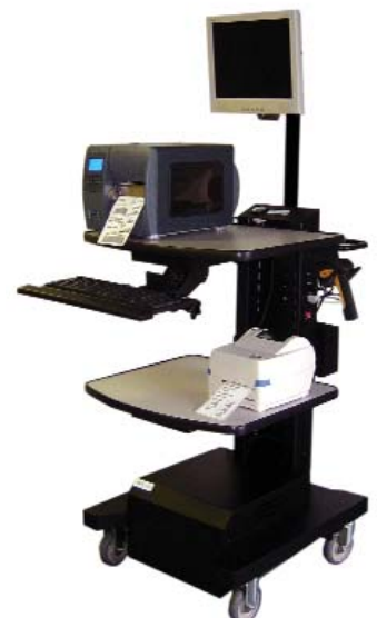
NB Series with Optional 2nd Shelf, LCD Post, Keyboard Tray, & Scanner Holder

Adjustable: Using a slotted upright system the shelves and accessories can be quickly adjusted to the most comfortable position