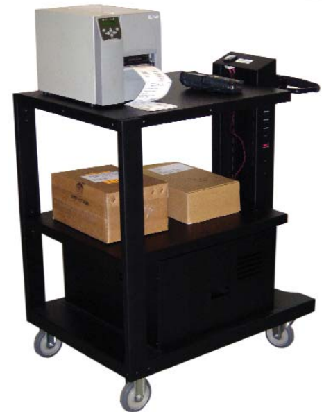
PC Series Mobile Powered Cart with Optional Second Shelf

Calculate your own savings with our new on-line ROI Calculator at www.newcastlesys.com/roi