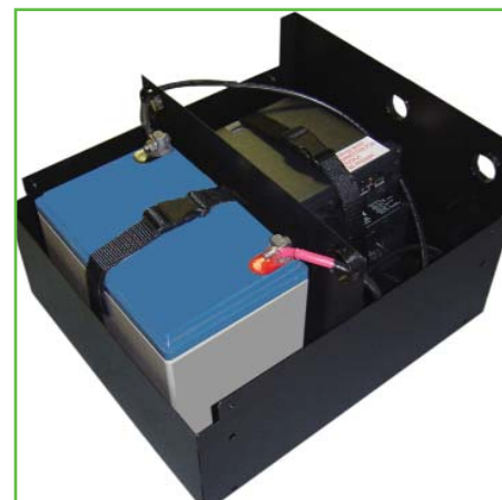
Power package (with cover off)

www.newcastlesys.com/Power-Packages.asp or call us directly at 781.935.3450